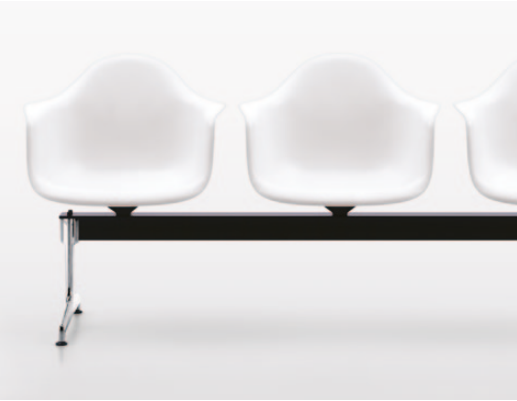
Several Eames Plastic Armchairs mounted on a crossbar are ideal for waiting areas.