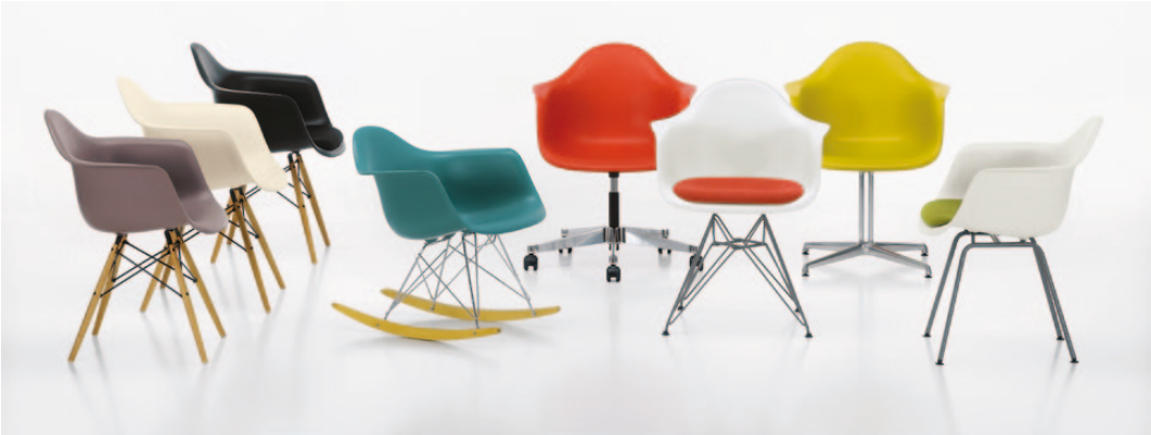
Depending on which colour, padding, and base you choose, the Plastic Armchair can fulfil all kinds of needs and preferences. RAR is not available upholstered.